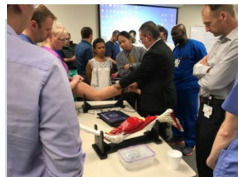
Larkin PM&R Residents at the Botox Workshop