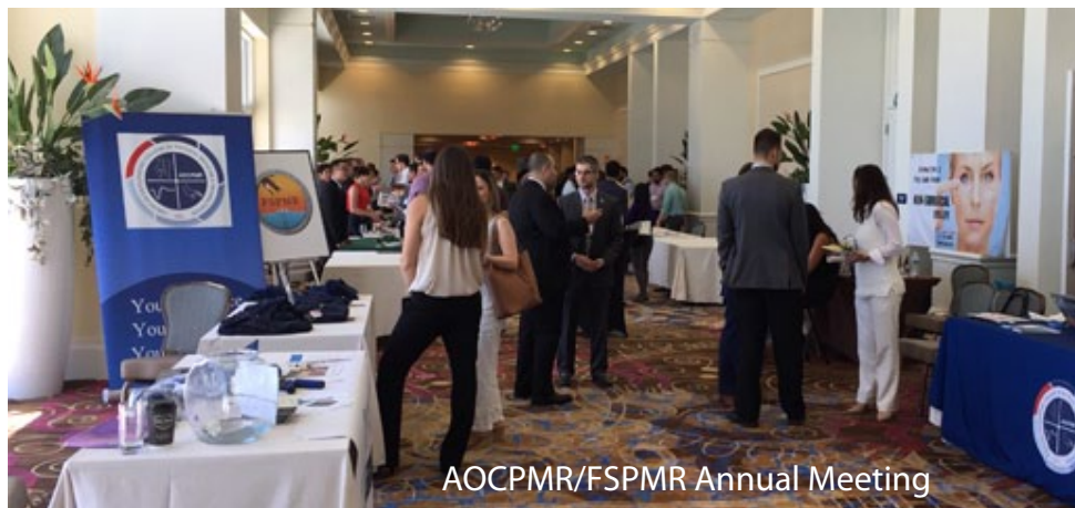
AOCPMR/FSPMR Annual Meeting