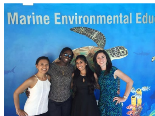
Larkin PM&R Residents at the AOCPMR Mid-Year Meeting Carpenter House Event