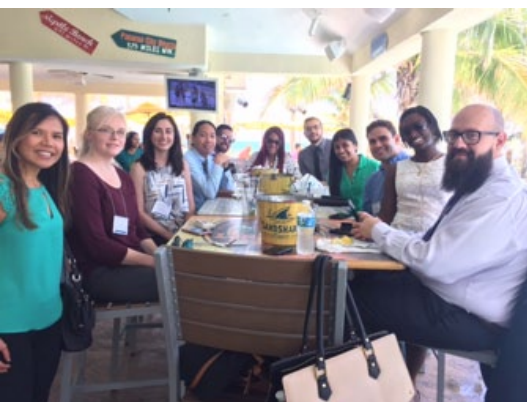
Larkin PM&R Residents at the AOCPMR Mid-Year Meeting